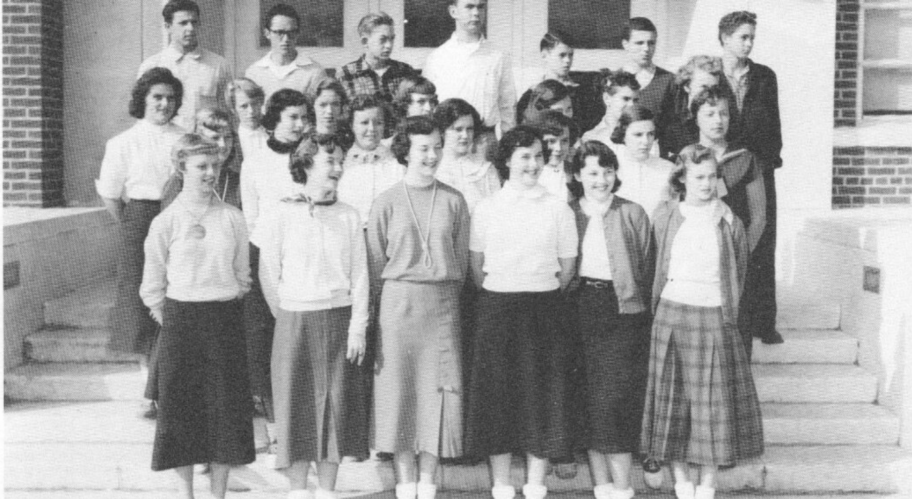
The Dramatics Class sponsors movies. See bulletin in Center Hall—first floor—for coming attractions.