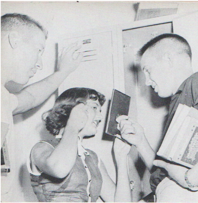
Our Junior Miss seems to find other things more interesting than books.