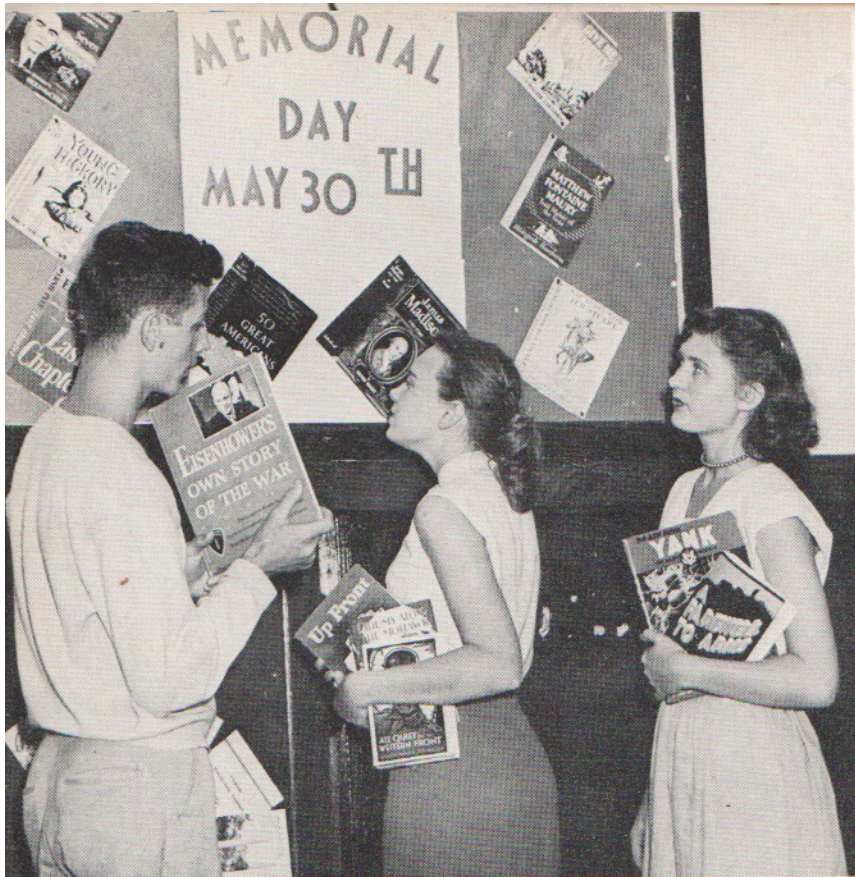
We read for understanding.