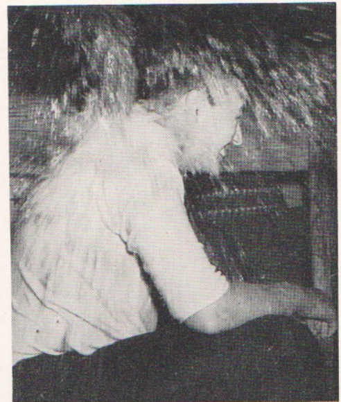
Did exams bring this on?