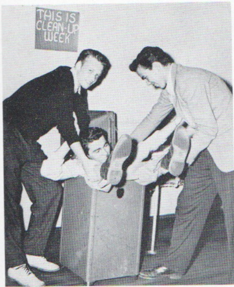
As always we carry out our tasks.