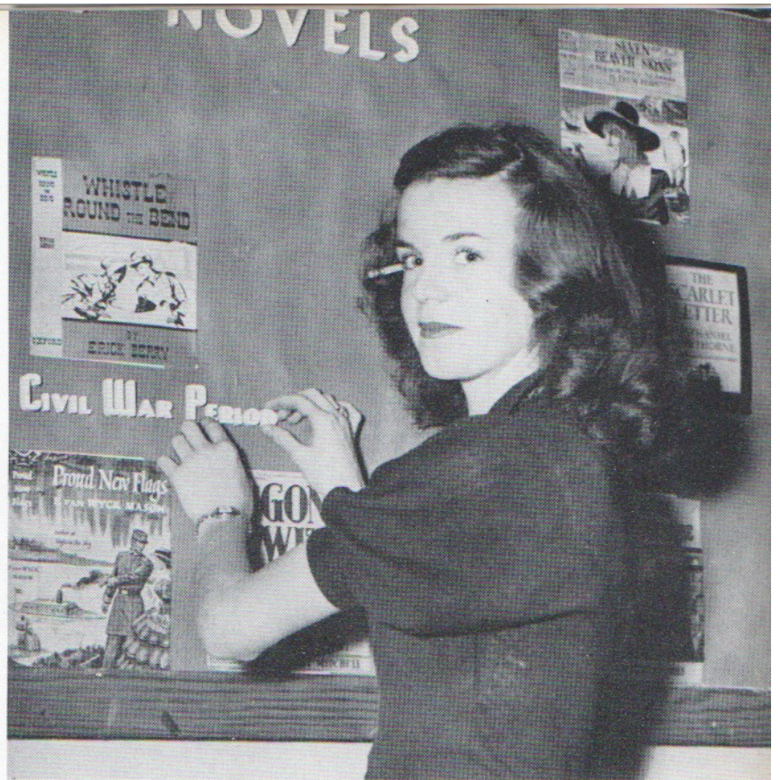
By doing we learn.