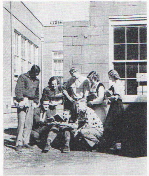
Last minute cramming for exams in front of the hut.