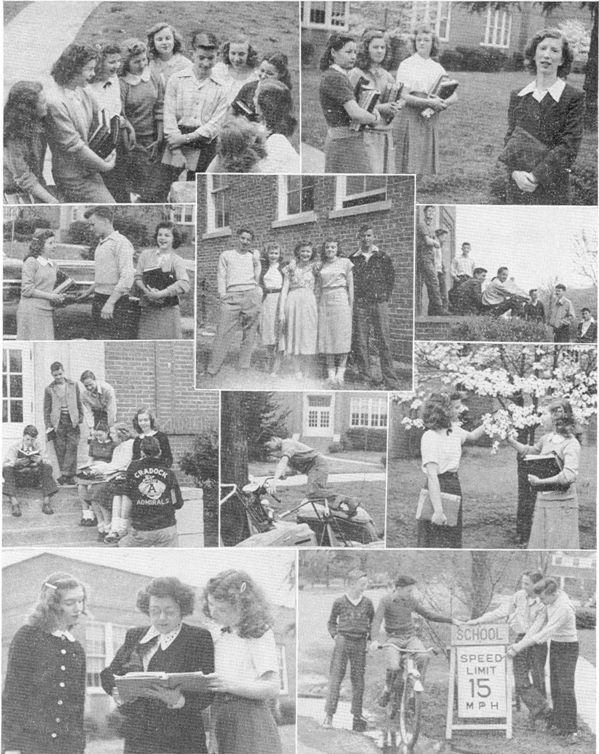
Surrounded by Admirers . . . What's up? . . . Want a Ride? . . . Posing? . . . Loafers Studios . . . What a Mess . . . Blossom Time . . . Oh, Oh, Caught! . . . The Law of the Land.